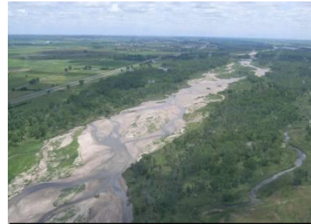
Overall goal – braided river channel free of invasive vegetation with moving sandbars

The WMA's have accomplished the initial control and are now focusing on monitoring and sustaining control within river channels. Yearly monitoring flights will supply needed information on any remaining infestations and help detect re-infestations at an early stage. Control techniques will occur on any detected infestations within channels of the Platte River. Infestations outside of river channels will be detected by aerial flights and county wide CIR imagery analysis. County weed districts will help implement cost share policy and ensure control measures.