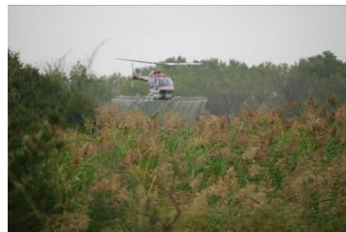
Aerial Herbicide Application on Phragmites

Aerial and ground application techniques were used to apply herbicide while disking and shredding were used for biomass removal. Bid packages were sent to all contractors that showed interest in the project. Contractors were selected on price, quality of previous work, references and time frame available. To date, the majority of applications have been performed by helicopter and the biomass removal has been both